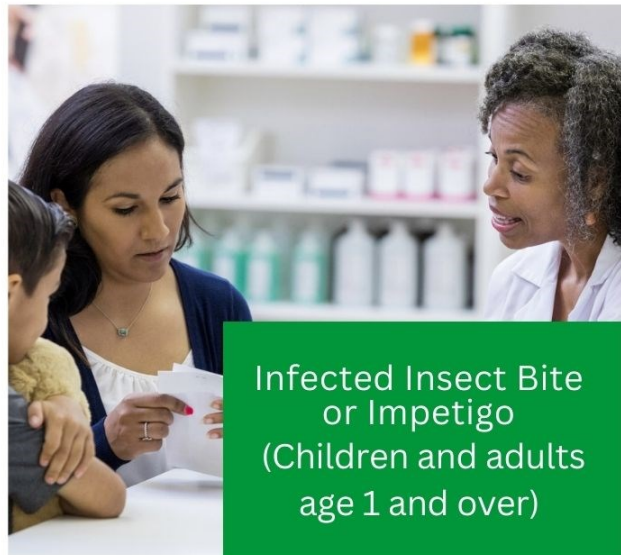
Infected Insect Bite or Impetigo (Children and adults age 1 and over)

When your child is ill with any of these conditions, head straight to your a local community pharmacy where you can have a consultation with a trained clinical professional and receive advice, guidance and even medication if it's needed. Lets get your child on the road to recovery as soon as possible.