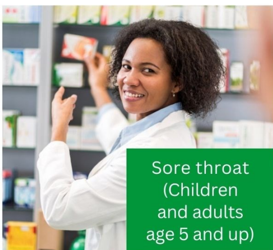
Sore throat (Children and adults age 5 and up)

The majority of Frimley Health and Care community pharmacies offer the Pharmacy First service.