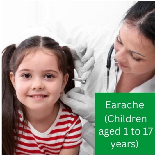
Earache (Children aged 1 to 17 years)

Did you know that community pharmacies can now offer clinical appointments with medication available (if required) for five clinical conditions particularly relevant to school age children?